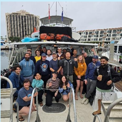
Kelp forest monitoring team

More information about this fascinating and important work, people and projects here: https://www.reefcheck.org/about-reef-check/