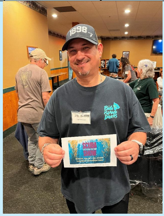
Tad also won a Scuba show pass